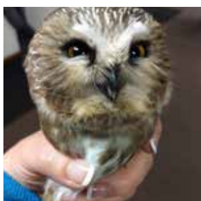
Citizen Science Update Pg. 2 Fall for owls at BCR!