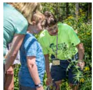
Volunteer Update Pg. 6