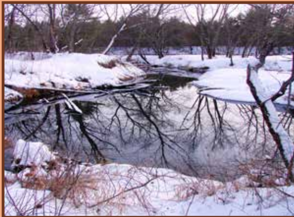
Winter reflections on the Eau Claire River backflow.

Another way to predict if the year will be a mild winter, is to get yourself the breastbone of a local goose that has recently passed on. If the bone is white, then winter will be mild, but if the bone is mottled then batten down the