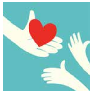
Season of Giving Pg. 7 So many ways to support BCR