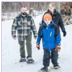
Winter Programs Pg. 4 Winter Recreation Time!