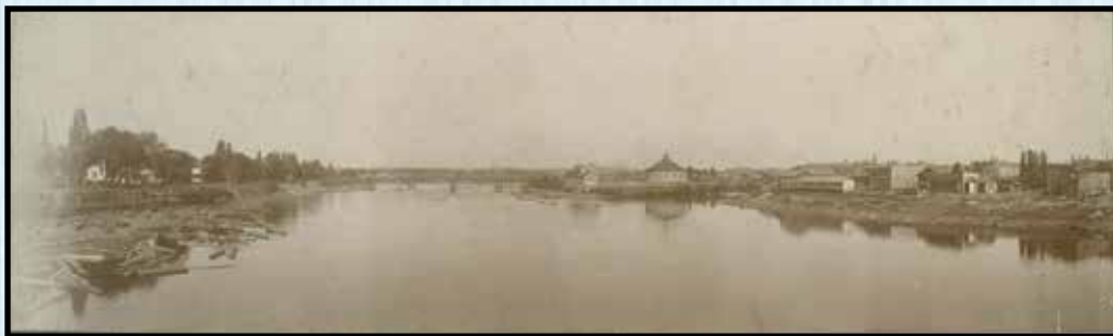
Confluence of the Chippewa and Eau Claire Rivers c. 1880.

The Chippewa River is a unique and beautiful resource. The Lower Chippewa River Area (LCRA) consists of the final 40 miles of the Chippewa River -- Wisconsin's second longest river -- before it meets the Mississippi. The Chippewa River has always been an important resource. As settlers came to this area, the Chippewa River was a vital resource for trade and travel. The timber industry and the mills on the river were directly responsible for the growth of Eau Claire and the surrounding towns. A lack of steep