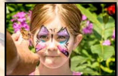
Nearly 350 visitors turned out for the annual Butterfly Fest, held August 5th.