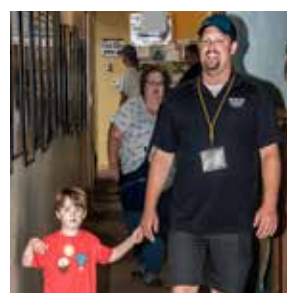
Directors Report Pg. 9 More updates to BCR Grounds