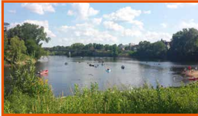
View of the Chippewa River from Phoenix Park.

1970's a nuclear power plant was proposed at a site along the lower Chippewa River. Because of public outcry this plan was eventually abandoned. Last year 1,000 acres of the property -- now known as the Tyrone Property -- was purchased by the Wisconsin Department of Natural Resources from Xcel Energy. This area which provides trail and river access for recreation and is also home to unique bird and insect species. In the late 1980's the Chippewa River State Trail was created and continued plans were made to