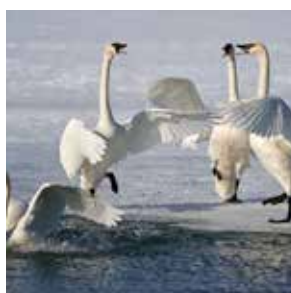
2018 Photo Contest Pg. 7 Learn more about the Karner