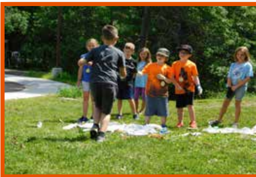
Sprouts campers play a recycling relay game outside the Wise Nature Center. .