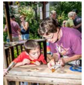
Volunteer Spotlight Pg. 10 Welcome New Volunteer Cord.