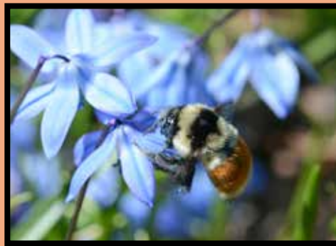
The Pollinator, by Lloyd Flieg (tricolored bumblebee (Bombus ternarius))

Solitary bees are non-aggressive bees that don't live in colonies. Each female makes her own nest in holes, tunnels, or hollow plant stems to lay her eggs in. They leave some pollen behind and seal the nest allowing for the new bee to care for itself.