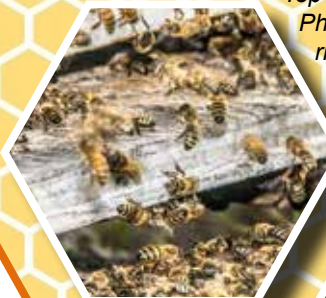
Top Left: Honeybees at Beaver Creek, Middle right: Perfect Pollinator (bumblebee). Bottom Left Lavender Visitor (honeybee).