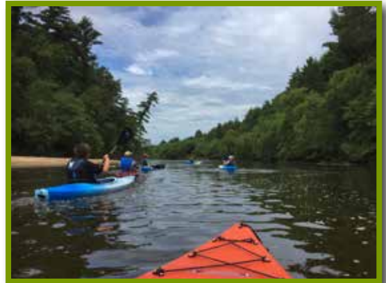
Kayaking & Geocaching was a new camp offered this year through our partnership with the ECASD.

Our Facebook page the day after the event shared pictures of kids and adults with face