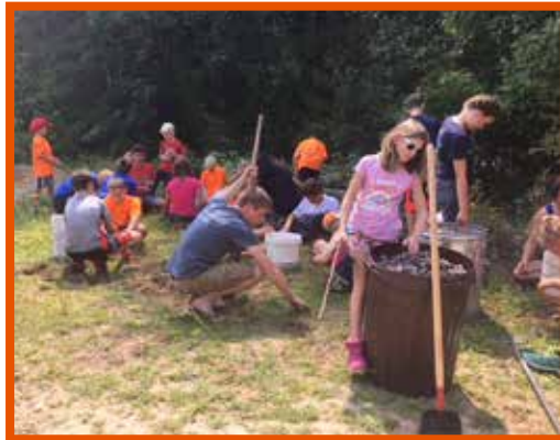
Good News Camp picking up rocks

In June and July we had an extremely successful Summer Camp Volunteer turnout. In the end we had over 37 volunteers