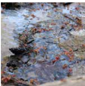
Citizen Science Update Pg. 2 NEW AIS Outreach Program