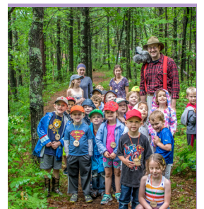
Summer Camp Preview Pg. 6 Save the date for ECASD Camps