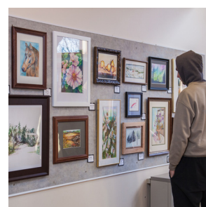
Colorful Milestone Pg. 3 CV Watercolorists 25th Anniversary