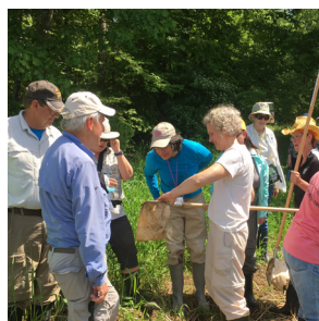
WI Master Naturalist 2019 Pg. 2 Returns to BCR in 2019!