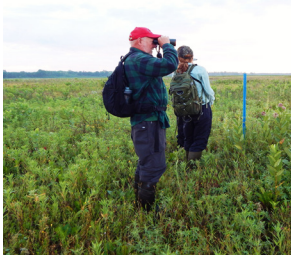
Bird School 2019 Pg. 2 Save the Date