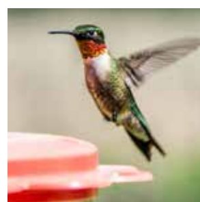
Naturalist Notes Pg. 6 HmMMMMMM!