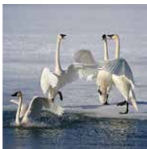
2019 Photo Contest Pg. 2 Opens March 1