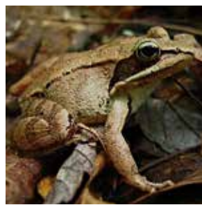
Spring Programs Pg. 4 CV Watercolorists 25th Anniversary