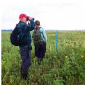
Bird School 2019 Pg. 2 Calling All Beginning Birders